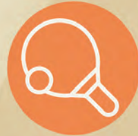
Table Tennis Facility & Pickleball Courts

Lowest crime rate of any city in Orange County