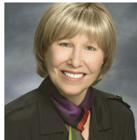
Shari Horne, Mayor The City of Laguna Woods

Shari Horne, Mayor of the City of Laguna Woods will discuss the results of Measure V and the prospect of having a marijuana dispensary in Laguna Woods.